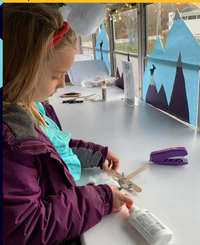
Goat Puppet Making in December 2022

New Director Position Created. MCC Card to Culture Program to Launch in January 2023 Art Experiences Offered to the General Public Networking with Social Service Orgs, State Agencies, and School Districts Developed New Relationships/Partnerships