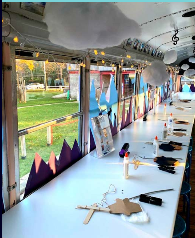
The Marjorie Lynne Decorated for the Sound of Music