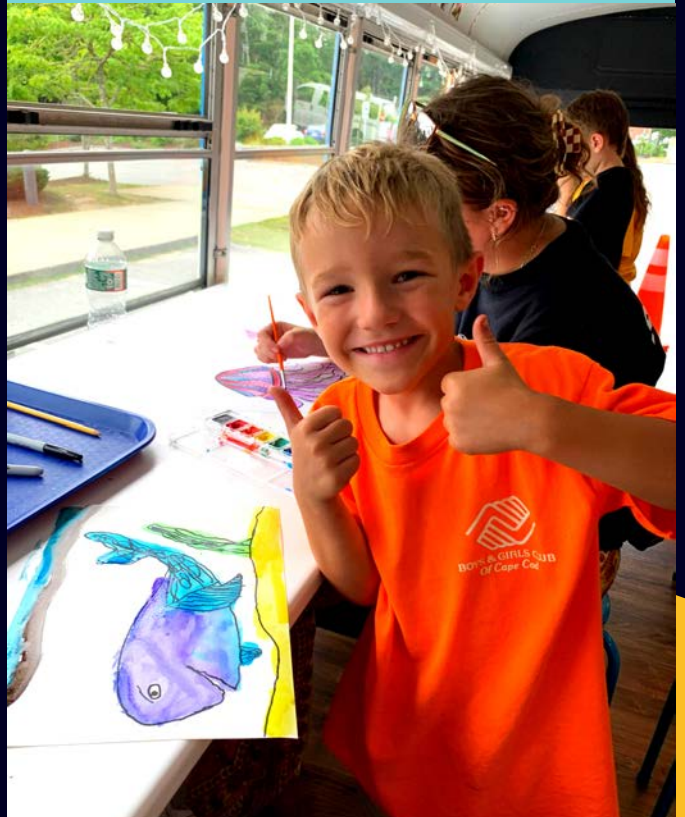
Boys and Girls Club, August 7 in Mashpee, MA with Grades 1-2