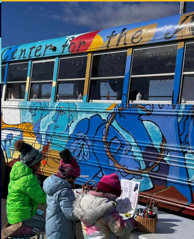
Yarmouth Winter Carnival 2023 Coloring Outside Waiting to Board the Bus

MCC Card to Culture Program Launched in January 2023 More Art Experiences Offered to the General Public Anticipate Serving 1800-2000 Youth and Adults in 2023. Already Exceeded Expectations Developed/Networked New Relationships/Partnerships