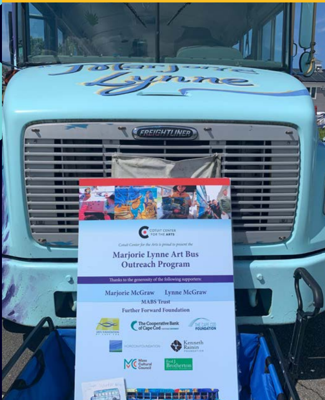
International Festival, August 13 in Hyannis, MA

MCC Card to Culture Program Launched in January 2023 More Art Experiences Offered to the General Public Anticipate Serving 1800-2000 Youth and Adults in 2023. Already Exceeded Expectations Developed/Networked New Relationships/Partnerships